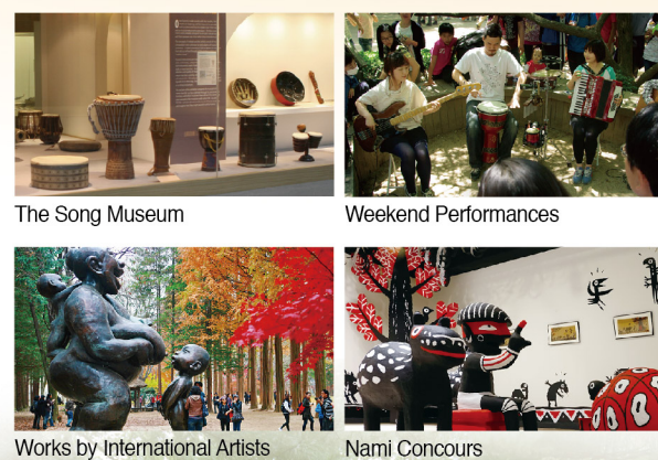
The Song Museum | Weekend Performances | Works by International Artists | Nami Concours

Nami Island is home to a variety of cultural events including exhibitions and performances. Consider us to be a 365-day-a-year festival!