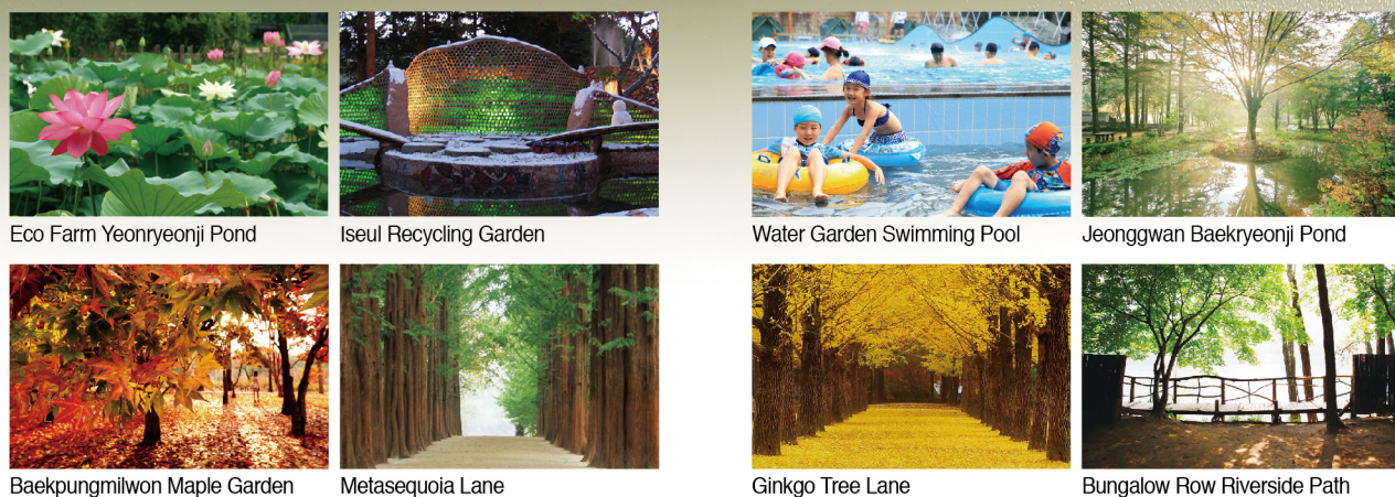
Eco Farm Yeonryeonji Pond | Iseul Recycling Garden | Water Garden Swimming Pool | Jeonggwan Baekryeonji Pond Baekpungmilwon Maple Garden | Metasequoia Lane | Ginkgo Tree Lane | Bungalow Row Riverside Path

This 460,000 square meter island, embroidered with breathtaking gardens and woods, Is where the walking paths greet the sunrise and sunset. These are the most beautiful gifts that Nami Island gives to her visitors.