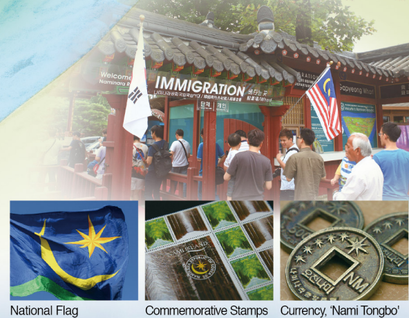
National Flag Commemorative Stamps Currency 'Nami Tongbo'

Years ago Nami Island declared its cultural independence and became Naminara Republic. We are a micro-nation and our exports are mainly imagination and fairy tales.